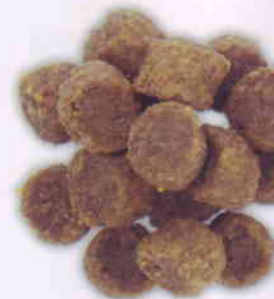
Science Plan Puppy with Chicken