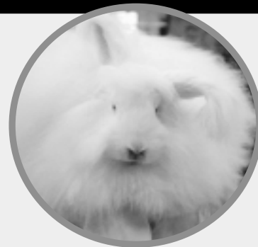
Angora in show coat