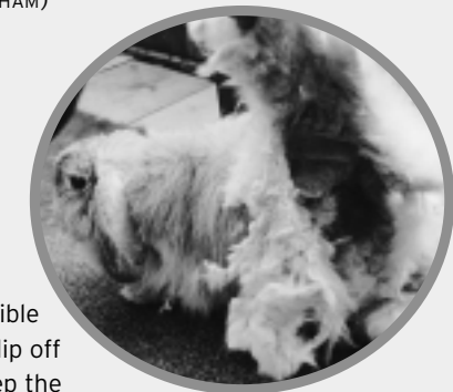
Matted fur being removed from a neglected Cashmere Lop