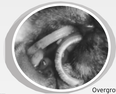
Overgrown front teeth

If you think your rabbit has a tooth problem, take him to the vet. He'll probably need to be sedated or anaesthetised for a careful examination. Clipping teeth at home is no longer advised.