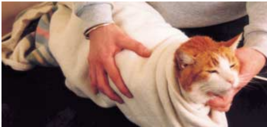
Picture 1: Take care when restraining a cat as he may try to scratch and bite

It may be necessary to restrain a cat in order to examine him effectively or administer some medication. The following information is for when you are frightened or worried about picking up your cat in the normal way.