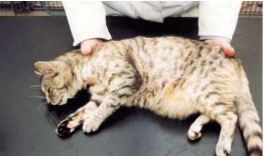
Picture 3: An unconscious cat should only be moved when absolutely necessary